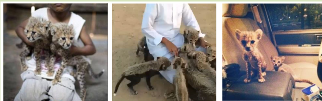
Cheetah adverts on social media.

CCF urges SC to consider this and other available confirmed data in the formulation of recommendations for CoP18.